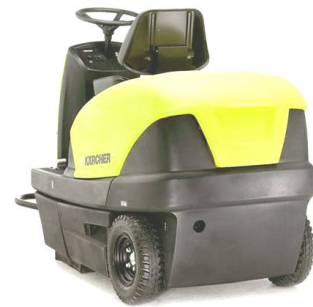
Robust construction – Made in Germany