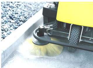
Side brush for edge cleaning

Big enough for large areas Compact enough to access tight spaces