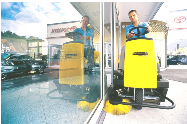
Outdoor use with Petrol, Diesel or LPG power