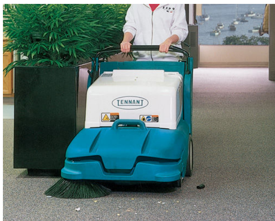
Powerful cleaning ability, with easy handling