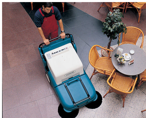
Suitable for commercial and industrial applications both inside and outside