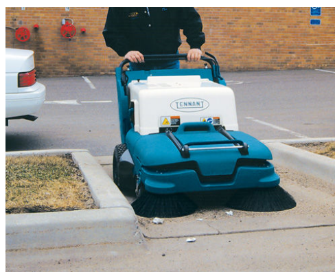
Optional wide track tyres and castors for car park and pavement sweeping

Call PowerVac now for an on site demo 08 9242 4751