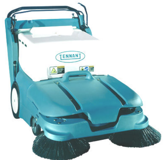
Tennant 3640 pictured with optional twin side brushes