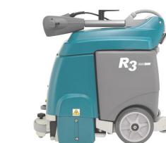
Folding handle for storage & Transport