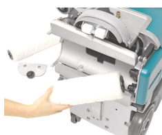
Easy to remove cleaning rollers & tanks